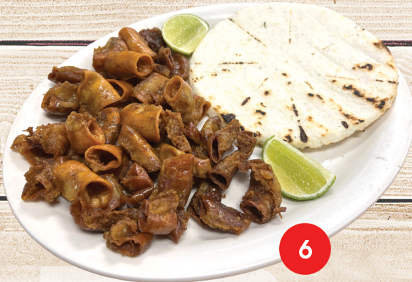
6 Chunchurria 8.00 Roast Tripe with Corn Cake