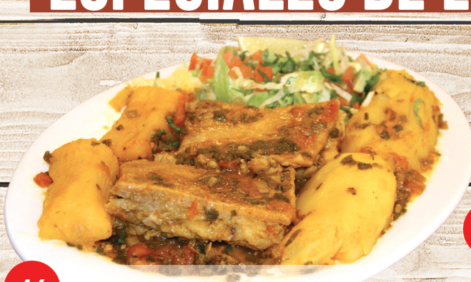
46 Sobrebarriga la Criolla 15.50 Top Flank in Creole Sauce