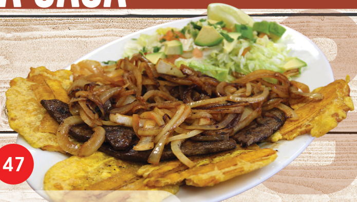
47 Carne Encebollada 15.50 Steak with Onions