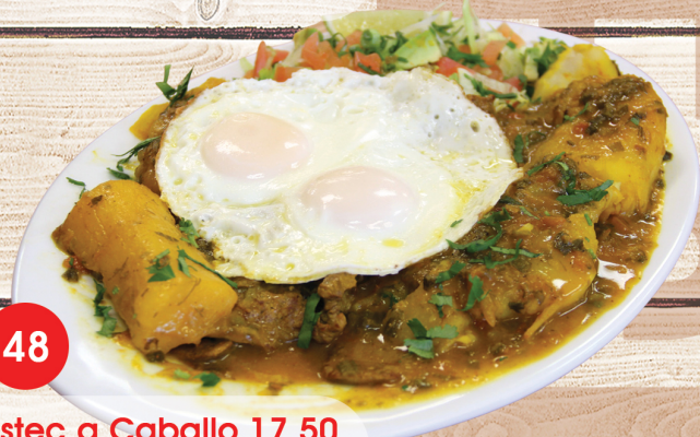
48 Bistec a Caballo 17.50 Beef Topped with Two Eggs