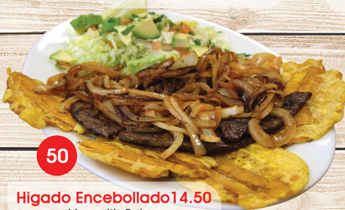
50 Hígado Encebollado 14.50 Liver with Onions