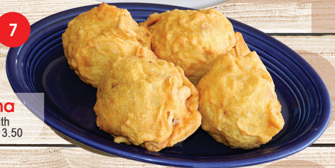
7 Papa Rellena Stuffed Potatoes with Beef 4.00 or Chicken 3.50