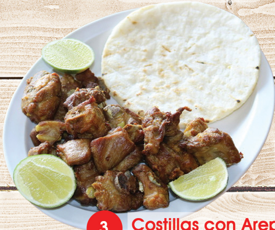
3 Costillas con Arepa 8.50 Tostones 10.50 Pork Ribs with Corn Cake or Plantain