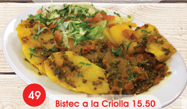
49 Bistec a la Criolla 15.50 Top Round in Creole Sauce