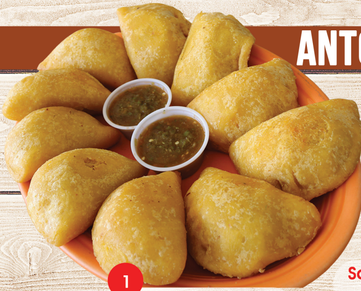
1 Empanadas Beef 2.00 or Chicken 1.75 Parties