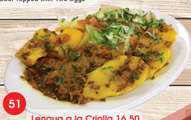
51 Lengua a la Criolla 16.50 Beef Tongue in Creole Sauce