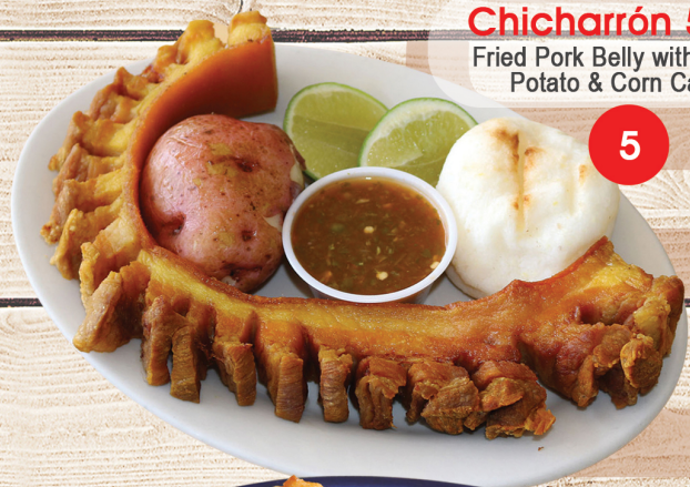
5 Chicharrón 5.00 Fried Pork Belly with Salty Potato & Corn Cake