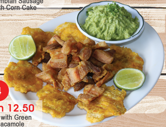
4 Chicharrón 12.50 Fried Pork Belly with Green Plantain & Guacamole