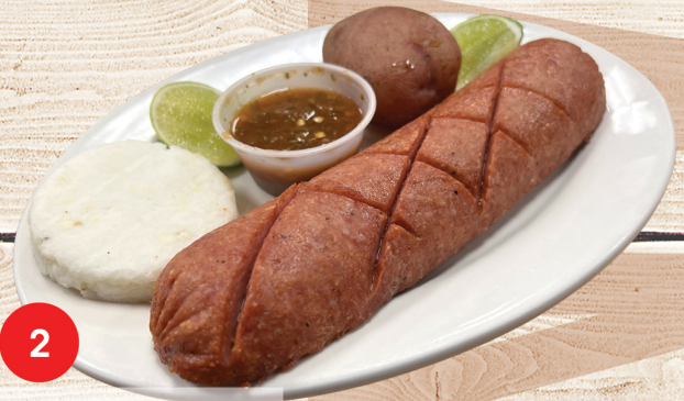
2 Sanchichón 3.50 Colombian Sausage with Corn Cake